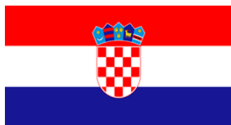
Republic of Croatia