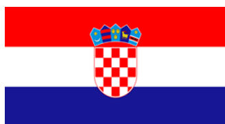
Republic of Croatia